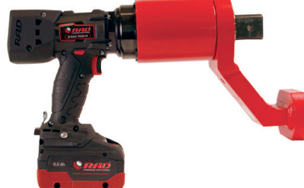
MB-RAD 7000 LIEBHERR