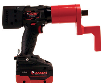
MB-RAD 1400 LIEBHERR

16HC175 (120HC) / M36 17HC200 (170HC) / M45 21HC290 (256HC) / M45