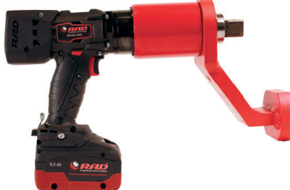
MB-RAD 4000 LIEBHERR